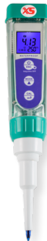
pH 5 FOOD