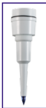
SPH51 Replaceable pH electrode for pH 5 Food