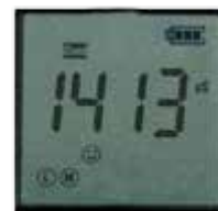
Display COND 1