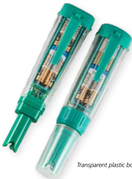
Transparent plastic body