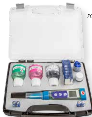
PC 5 kit