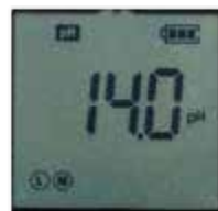
Display pH 1