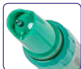
ORP 51 replacement electrode for ORP 5