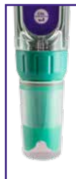
Protection cap used like calibration beaker