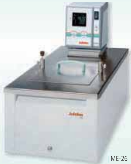
ME-26 with integrated immersion-height adjustable platform