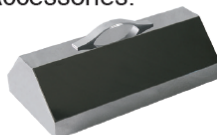
Dome lid for shaking water bath WSB