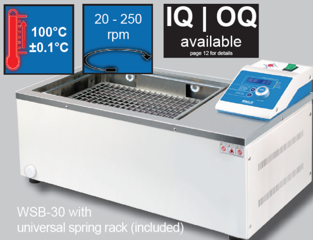
WSB-30 with universal spring rack (included)

shaking water bath, 18 / 30 / 45 l, up to 100°C ±0.1°C, shaking stroke 20mm