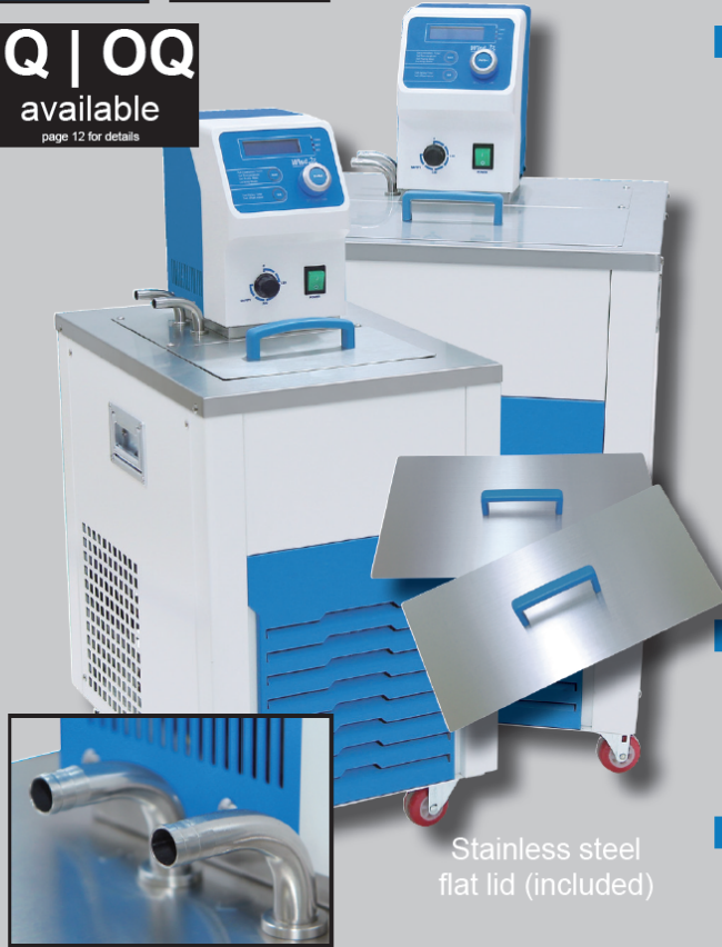
Stainless steel flat lid (included)