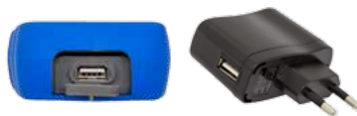
USB output for data and power supply via PC or main power supply supplied as standard (PC 70+ DHS)