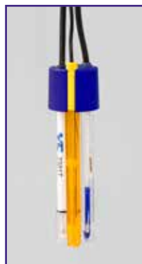
3 holes field support for electrodes