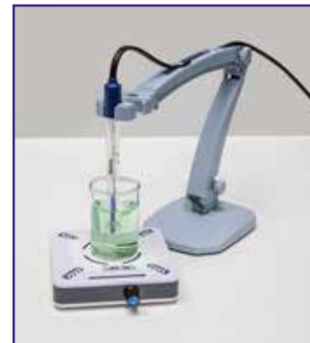
Stand for use on desk (optional) and stirrer ST 10