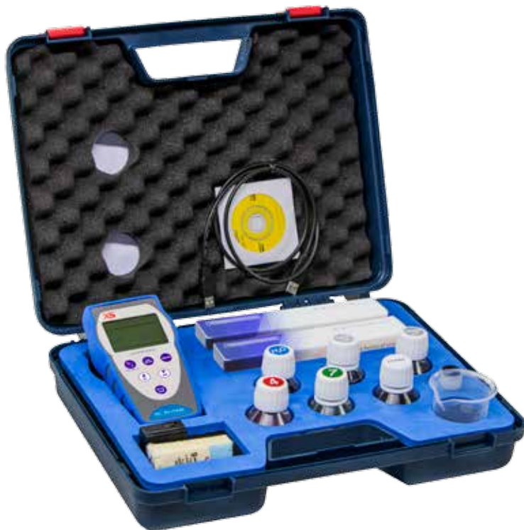
Complete carrying case with accessories, useful for use as a portable laboratory