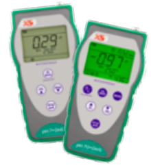
pH pH 7+ DHS - pH 70+ DHS