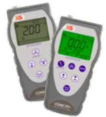
Conductivity COND 7+ - COND 70+