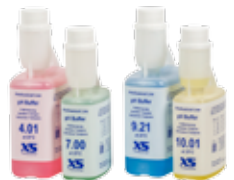
Certificated buffer solutions