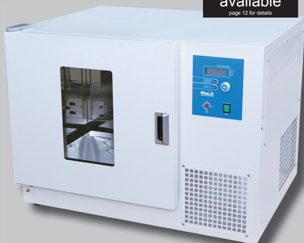
WIS-30 with universal platform (included)