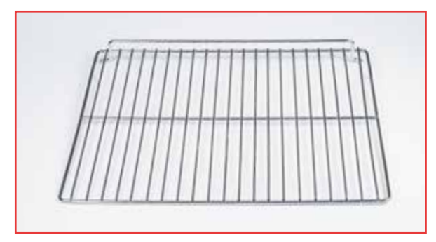
Steel wire shelf for TCN and TCF models

The minimum heating times, the heating power properly dimensioned and the perfect tightness of the gasket, ensure low energy consumptions in every application.