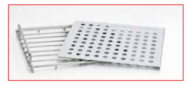
Holed platform applicable to wire shelf for TCN and TCF models