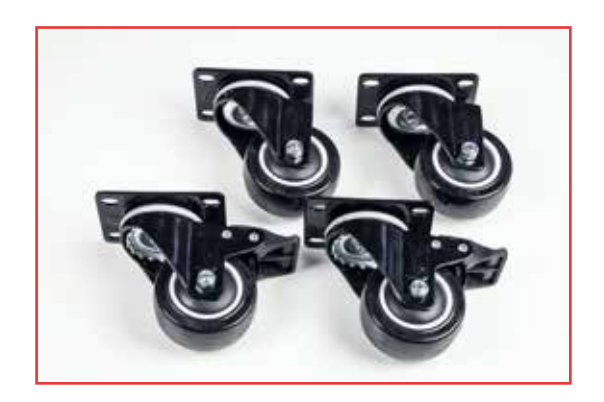
Wheels for TCN 200, TCF 200 and TCF 400

The forced air circulation, adjustable in three levels (High, Medium, Low), guarantees the perfect air replacement and homogeneity of temperature in every parts of the chamber.