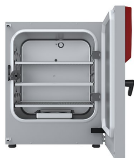
Model CB 170