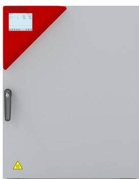
Model CB 170