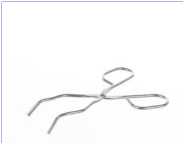
Crucible tong with ridges, stainless steel