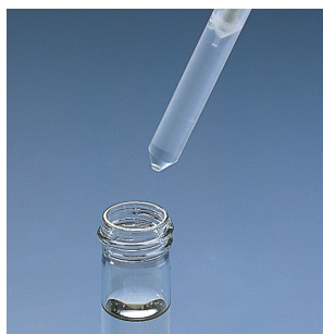
Media with high vapor pressure