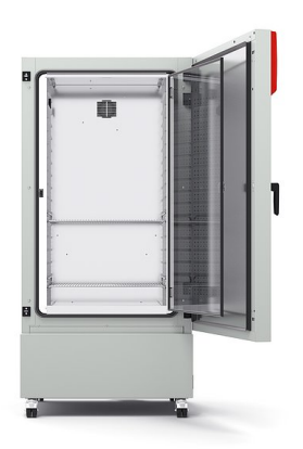
Model KB ECO 400