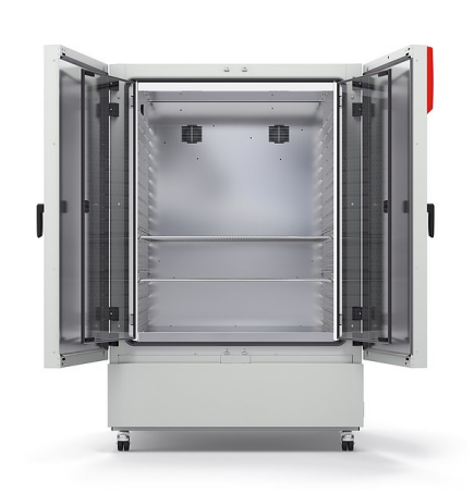
Model KB ECO 1020