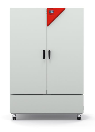
Model KB ECO 1020