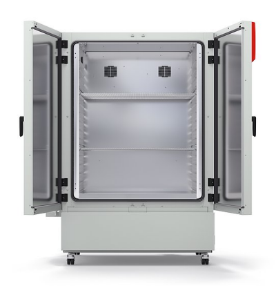
Model KBF-S ECO 720