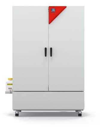
Model KBF-S ECO 720