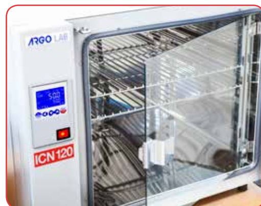
Internal glass door